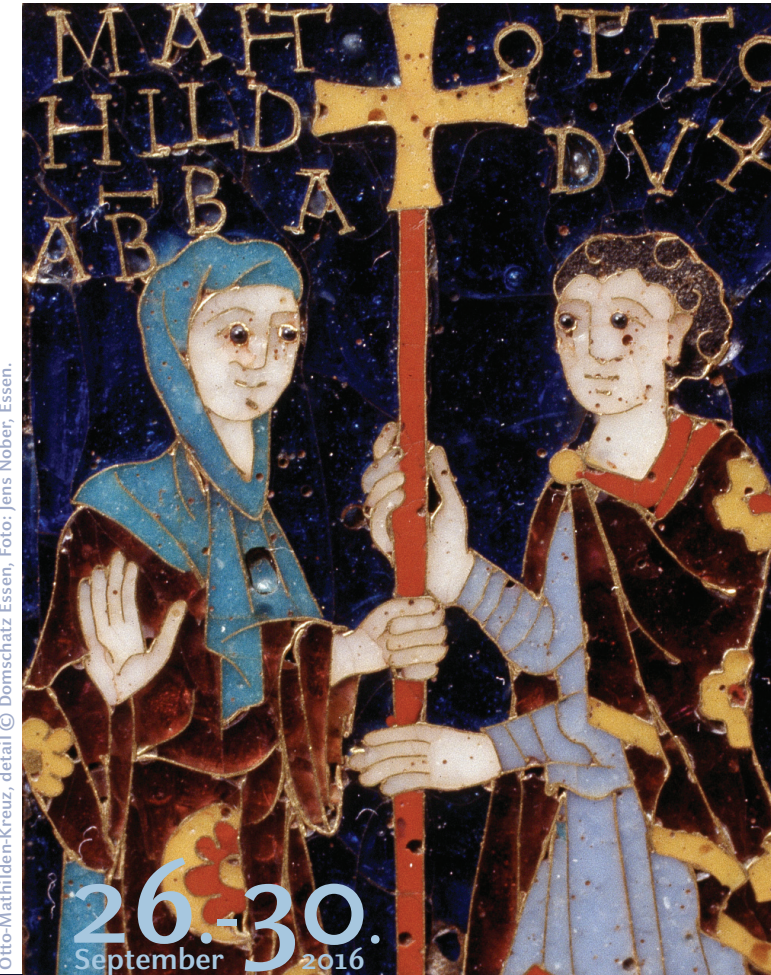
Otto-Mathilden-Kreuz, detail